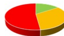
Low Systems Engineering Capability